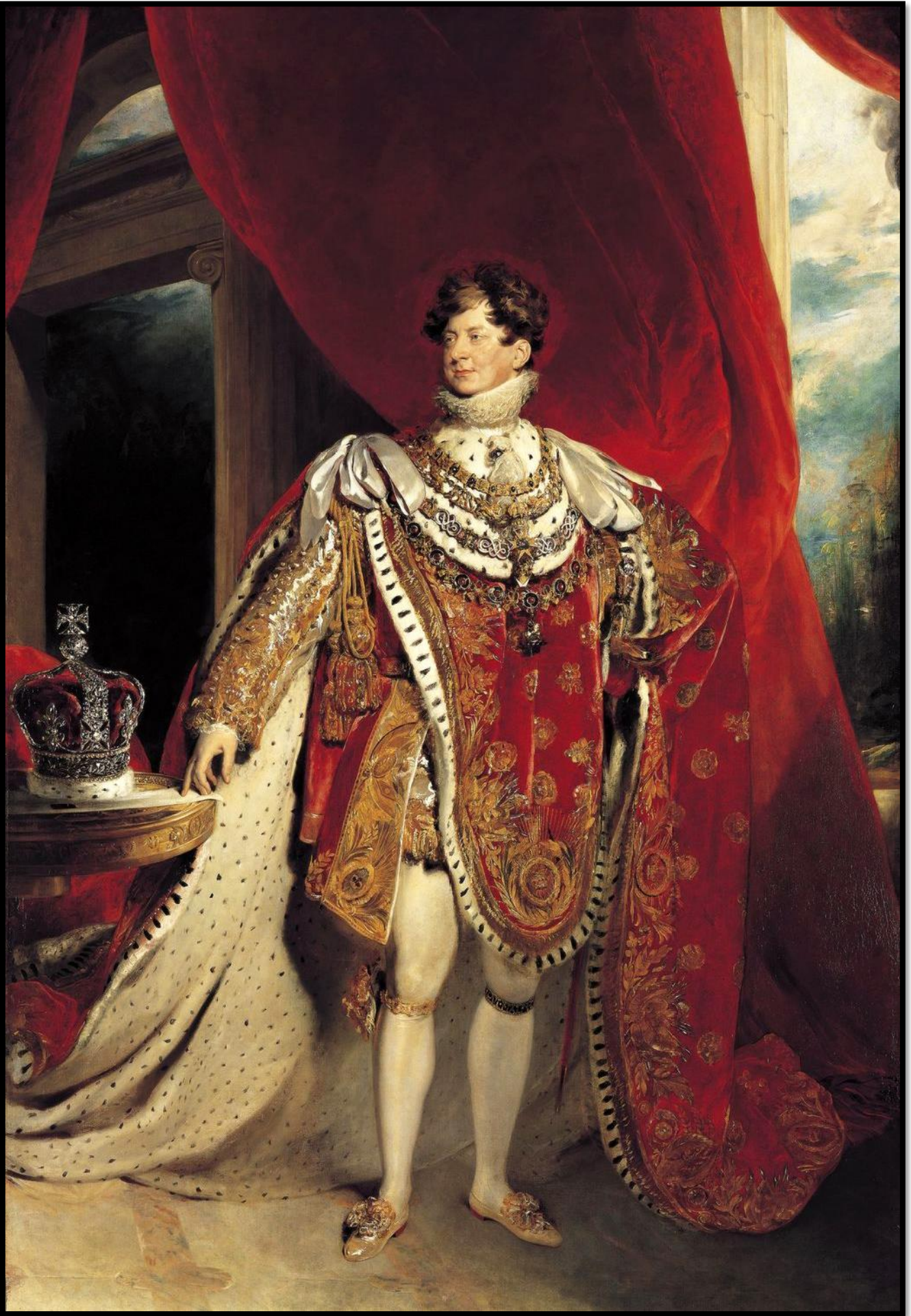
King George IV Coronation Day 19 th July 1821