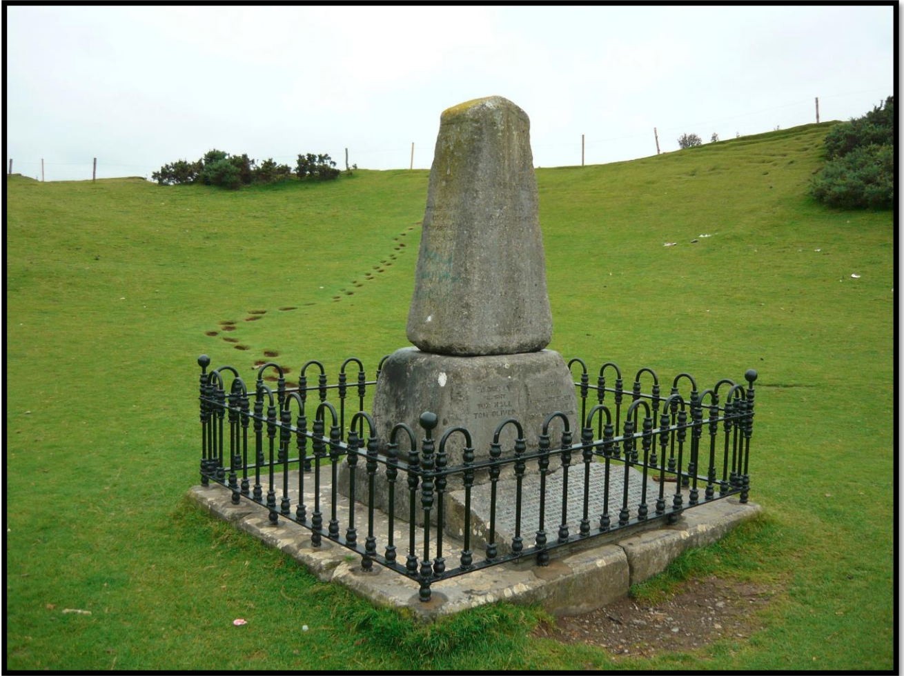
Cavalry Camp, Donnelly's Hollow, Curragh Camp.